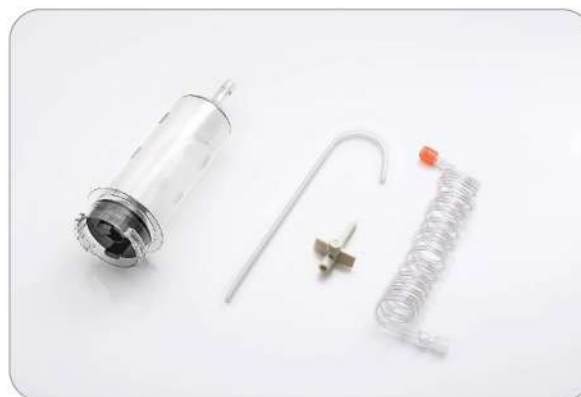
· 200ml Syringe for Contrast